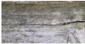
none 35 (1024x512)