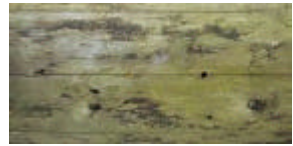
none 36 (1024x512)