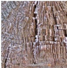
none 38 (1024x1024)