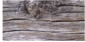
none 33 (1024x512)