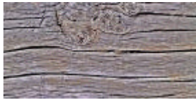
none 34 (1024x512)