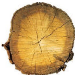
none 43 (1024x1024)