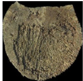
none 39 (1024x1024)