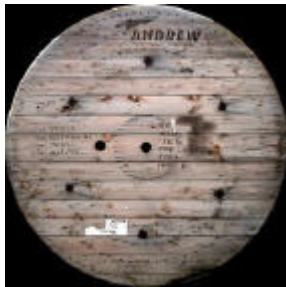
none 37 (1024x1024)