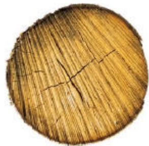
none 42 (1024x1024)