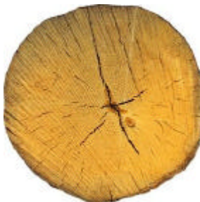
none 41 (1024x1024)